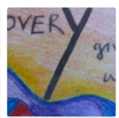
The Varieties of Recovery Experience