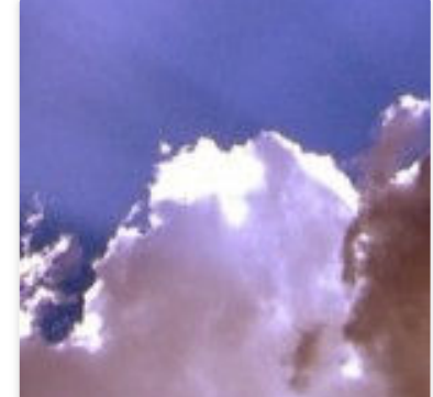
The Spirituality of Imperfection