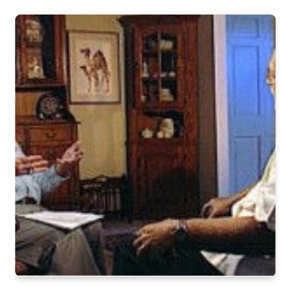
AA Agnostica and the Varieties of AA Experience